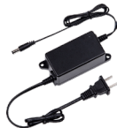
PFM320 12V 2A Power Adapter