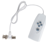
PFM820 UTC Controller