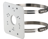
PFA152-E Pole mount