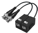
PFM800-E Passive HDCVI Balun